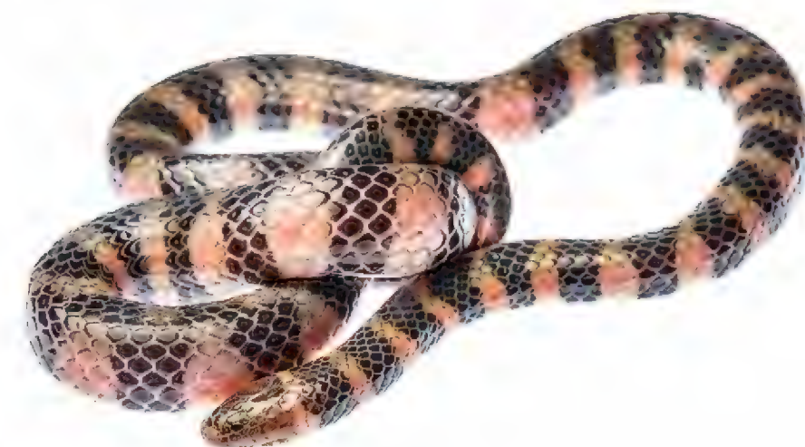
Fig. 2. Hydrops triangularis (photographic voucher Nbr. PERU2016_5732) recorded at Los Amigos Biological Station, Madre de Dios, Peru.